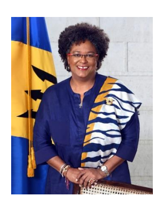
H.E. Ms. Mia Mottley

Convened by the UN SG 24 Sept. 2024 13:30-15:15 ECOSOC Chamber, UN HQ