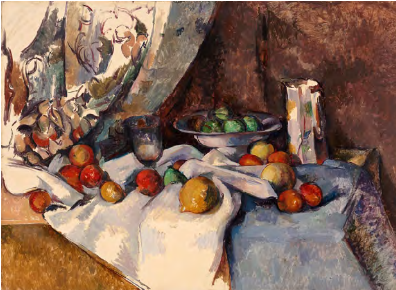
Paul Cézanne. French 1839–1906.

As with previous visits the event will commence with a lecture about MoMA at 11.00am, then on to a viewing of the exhibition and followed by an excellent lunch in the Café Vic.