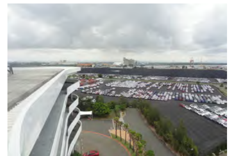
Experience the best views of the Port from the Visitor's Centre's Observation Deck.

For all enquiries please contact Geoff Cowles OAM, Secretary, phone 3351 4991 or email secqld@theorderofaustralia.asn.au