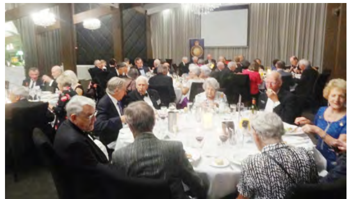
Some of the 133 guests enjoying good fellowship at the Annual Dinner.