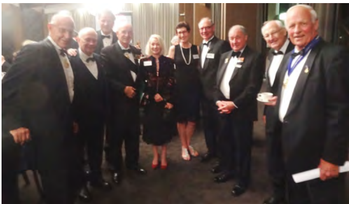
Our guest speaker (4th from left) attracts quite a following at the Annual Dinner.