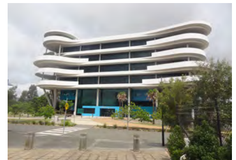
The modern architectural Visitor's Centre with Observation Deck on top floor.

So it's "Ship Ahoy!" by making sure you book to see the Port of Brisbane in action with a morning tea included for good measure.