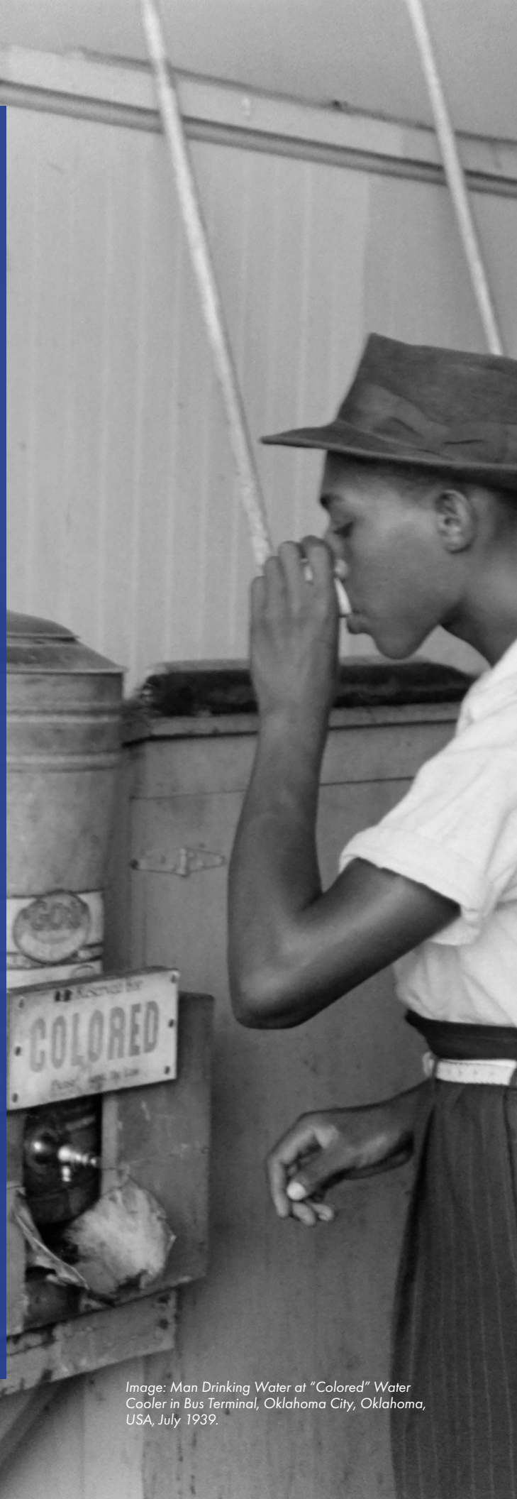
Image: Man Drinking Water at "Colored" Water Cooler in Bus Terminal, Oklahoma City, Oklahoma, USA, July 1939.

At the time, legal analysts predicted the Shaw decision would have significant consequences nationwide, ensuring that Black communities would not be deprived of essential municipal services like water and sewer. However, the Supreme Court later determined that an Equal Protection claim requires plaintiffs to meet a higher standard of proving intentional discrimination, which the plaintiffs in Shaw were not required to demonstrate. The court's ruling has effectively insulated most local governments from lawsuits; since then, very few municipalities have been found liable for racial discrimination in the provision of public water and sewer services under the 14th Amendment to the U.S. Constitution.