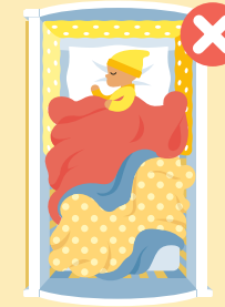
Pillows, duvets or thick heavy bedding