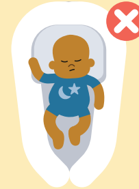
Pods or nests

Unfortunately, not all products available in the shops and online comply with safer sleep advice. So, it's a good idea to familiarise yourself with the items we recommend you DO NOT buy for your baby: