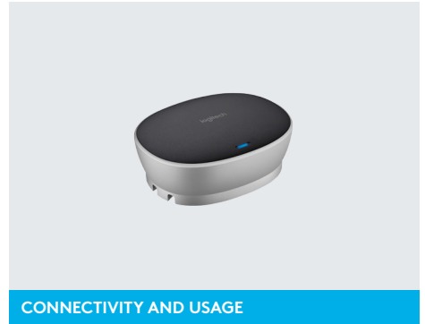
CONNECTIVITY AND USAGE

Simply plug the speakerphone into the powered hub with the supplied 4.9 m/16' cable to get up and running in no time.