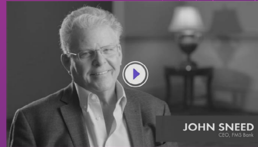
Watch: FMS Bank reduces nine third-party vendors with Fusion Phoenix

// One of the reasons we switched to Phoenix was because it reduced our reliance on third-party providers by nine significant third-party providers. //