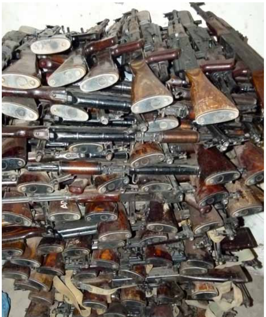
Image 1 Stacked firearms observed at a South Sudan storage facility

This Brief examines the current management of surplus firearms in South Sudan's state security forces that are under the aegis of the Ministry of Interior: the South Sudanese National Police Service (SSNPS), the South Sudan Prison Service, Wildlife Protection Services, and the Fire