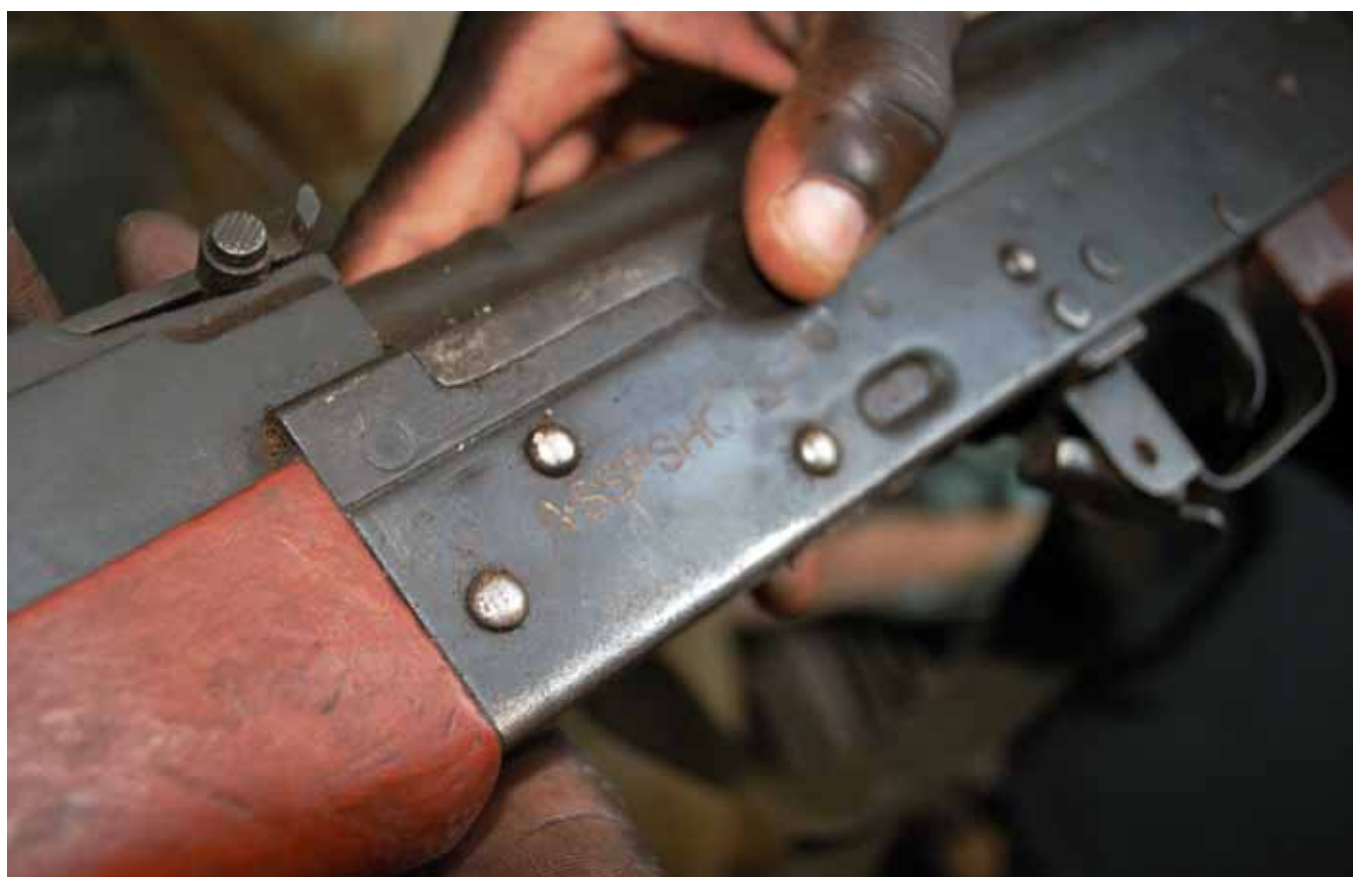
Image 5 Markings on a South Sudan National Police Service (SSNPS, formerly SSPS) rifle

These records are incomplete, however, and do not constitute a national inventory. Previous holdings (those possessed by the security forces before the 2010 imports) are not registered in a national database and these older items remain scattered throughout the security forces' armouries across the country. It was thought that