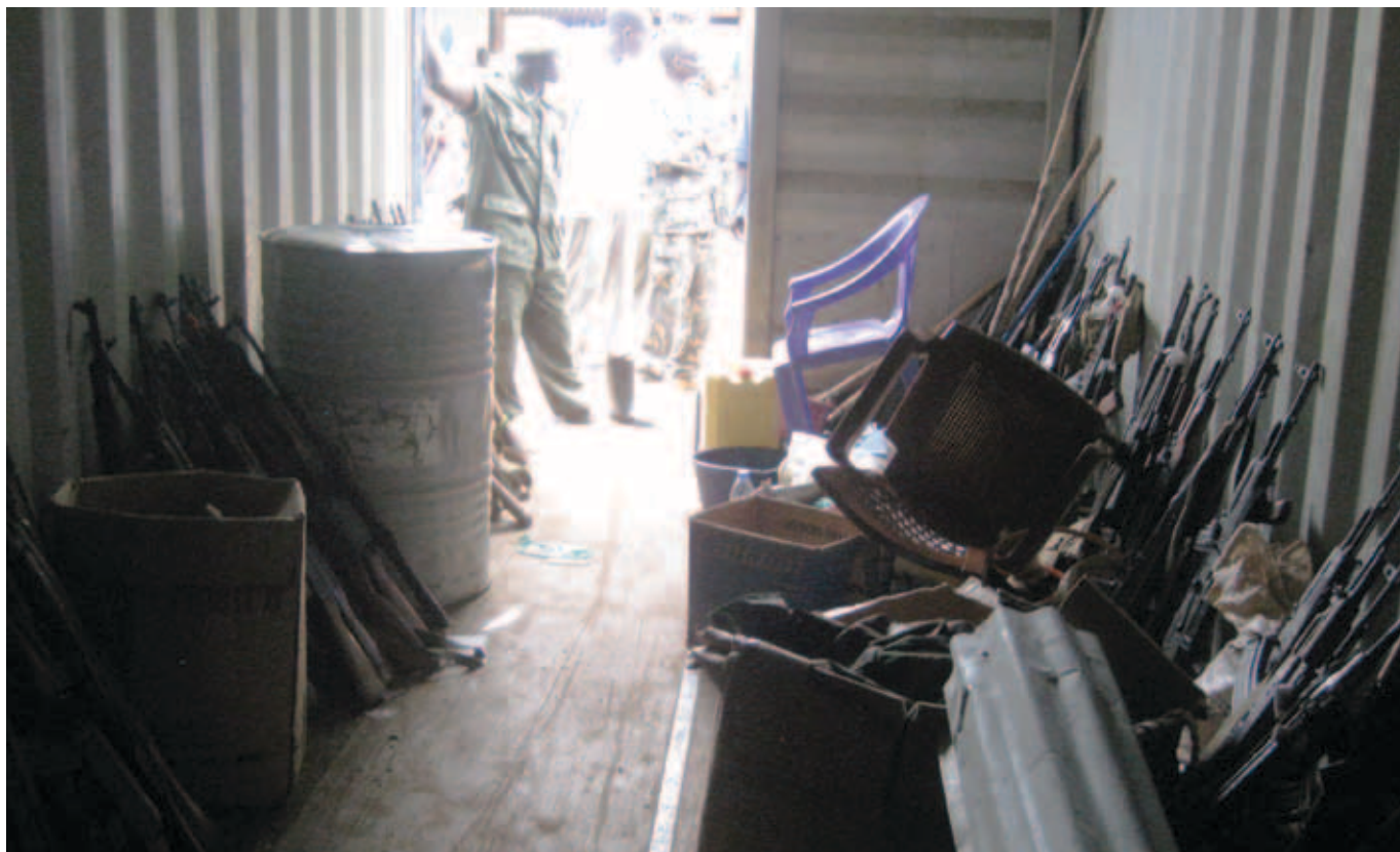
Image 3 A storage container with operational weapons on one side, and obsolete and surplus weapons on the other

The SSNPS Regulations also contain substantive measures conducive to monitoring the quality and condition of arms. If followed, these regulations could offer SSNPS officials the information needed to identify non-serviceable weapons and to calculate surplus. According to the regulations, each police headquarters and unit under its supervision is to maintain a 'gross' registry of every arm received, issued, and remaining in its holdings (GoSS, 2010, art. 52a). The registry should include identification information pertaining to each firearm and its parts (bolt, barrel, and 'metallic' number), as well as to the officer allocated and the unit (GoSS, 2010, art. 52d). The condition of the equipment should be categorized as well as 'Good', 'Fair', or 'Damaged' (GoSS, 2010, art. 47a). The unit head then recommends that all 'Damaged' items be condemned (GoSS, 2010, art. 54a). Once referred for 'condemnation', the Arms Unit must inspect the weapon to determine if repairs or 'condemnation' is necessary (GoSS, 2010, art. 54c). It is unclear whether the 'condemned'