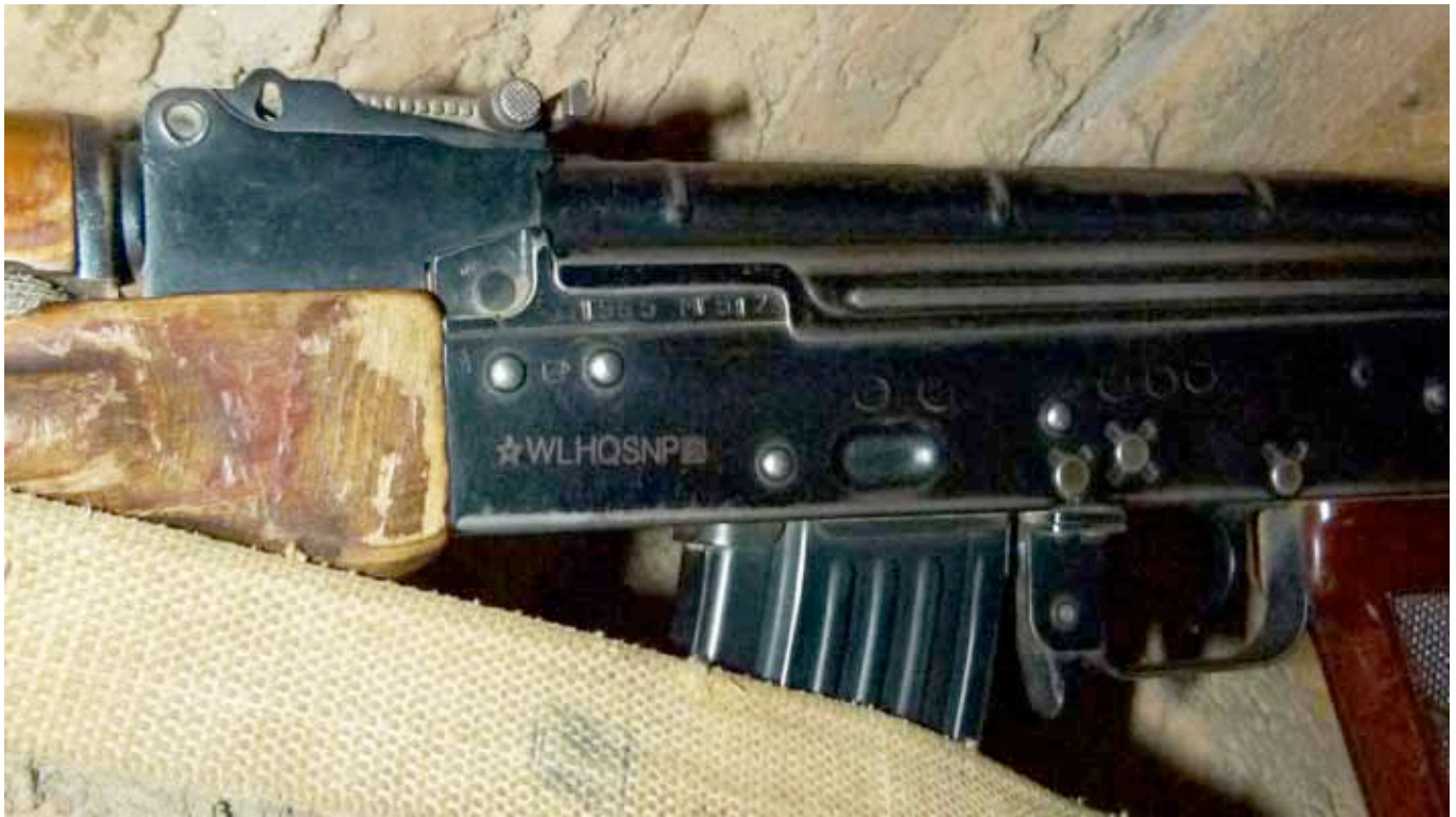
Image 4 Markings on a Wildlife Services rifle

status then requires destruction or other actions to be taken.