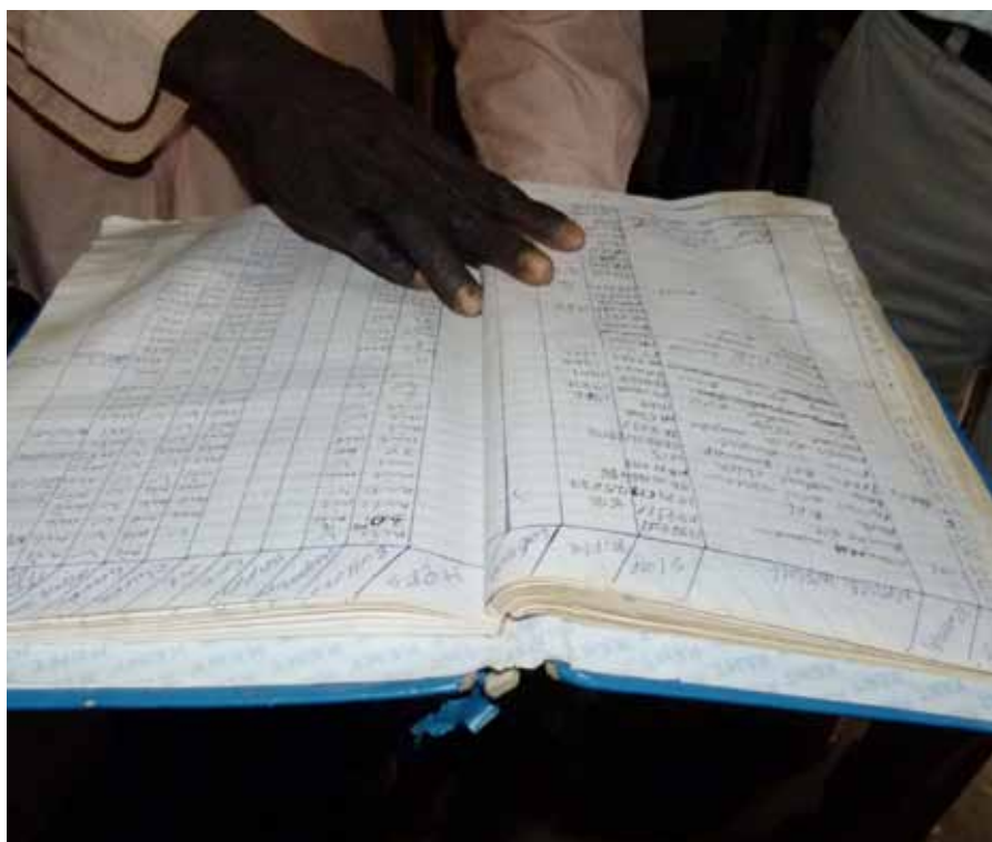
Image 2 A general ledger recording operational firearms

regularly review ... the stocks of small arms and light weapons held by armed forces, police and other authorized bodies and ... ensure that such stocks declared by competent national authorities to be surplus to requirements are clearly identified, that programmes for the responsible disposal, preferably through destruction, of such stocks are established and implemented