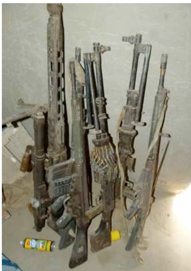
Image 8a and 8b Military material and NATO-standard items found in a store

Once surplus is identified, the management process begins. ISACS recommends that surplus pass through three basic management steps: declared, stored separately, and then disposed of permanently (UNCASA, 2012, section 12.1).