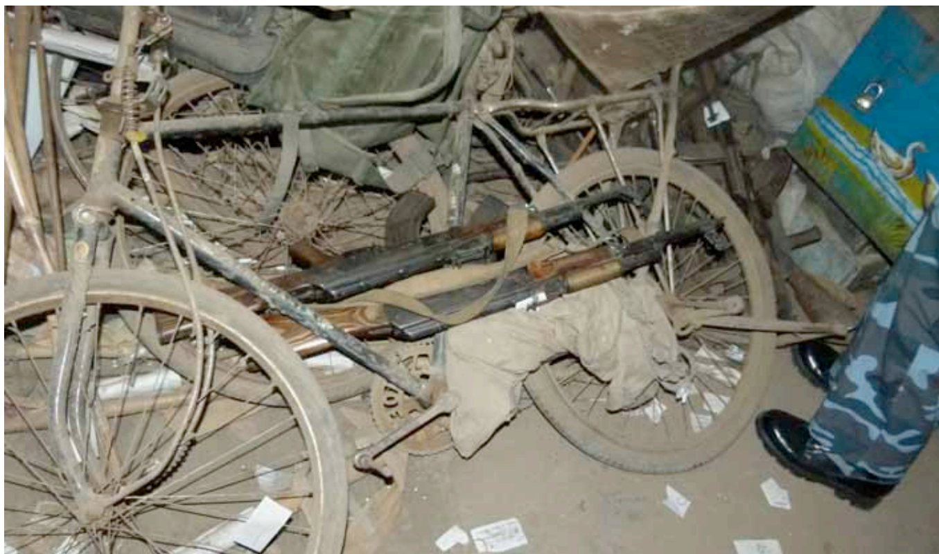
Image 6 Unrecorded firearms at a state security forces storage facility

there were more detailed data held at the state level, 25 but this was not observed in practice.