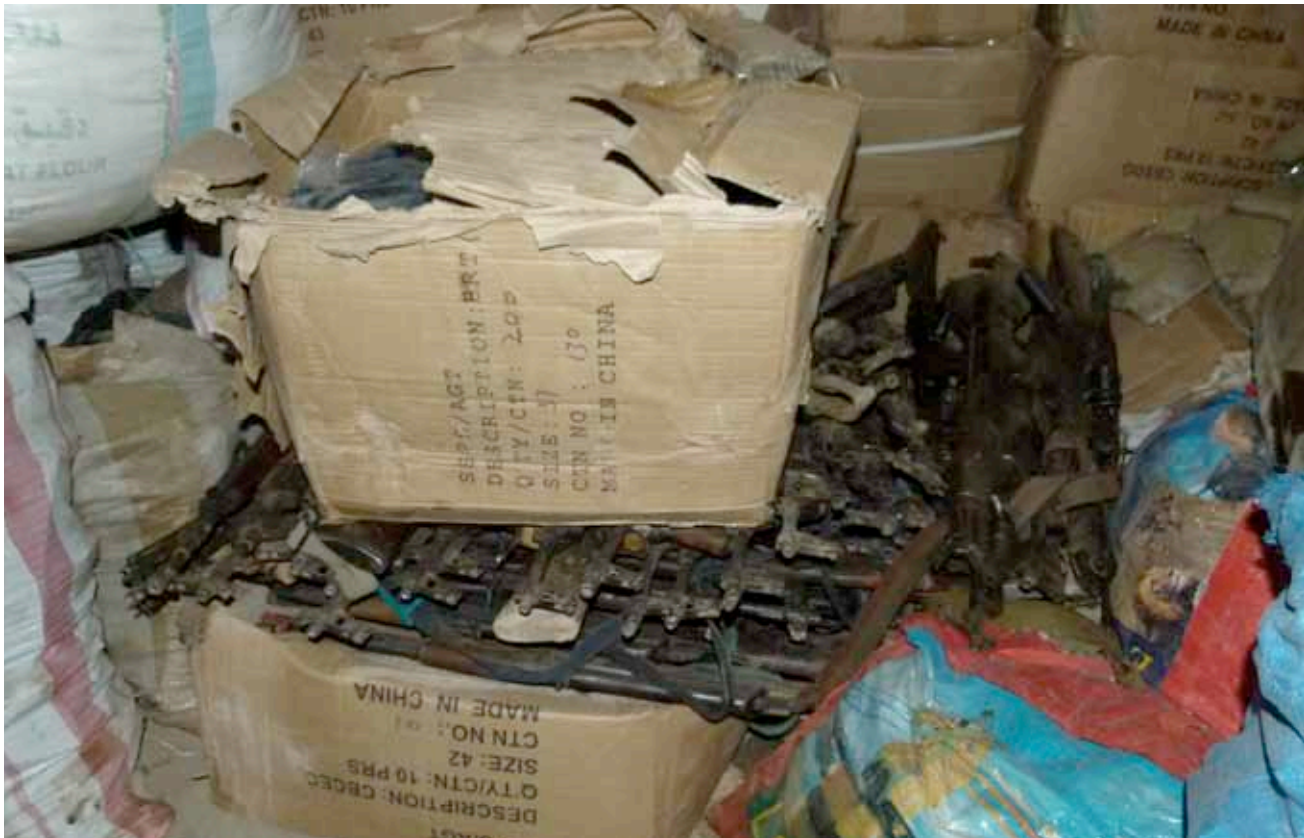
Image 10 Firearms and non-weaponry items found in a storage site

security forces to destroy 'state property' (GoSS, 2011b, chap. 8, s. 50; GoSS, 2011c, chap. 7, s. 52).