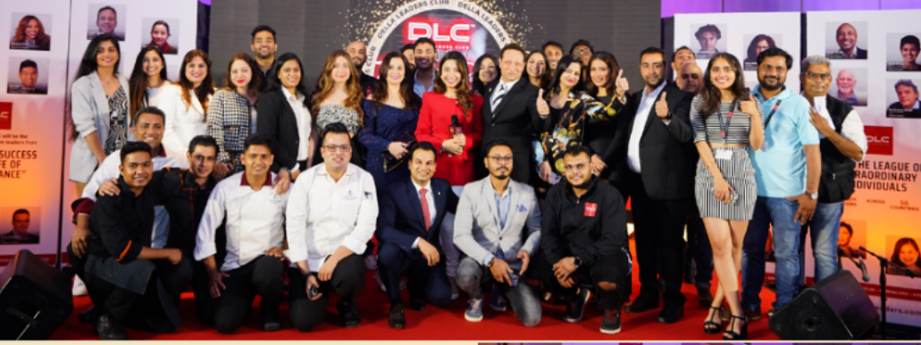
Genie, YouTurn Events, 19 Global Summits and Chapter Retreats.