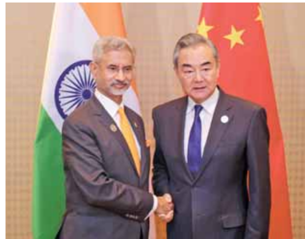
External Affairs Minister S Jaishankar in a meeting with China's Foreign Minister Wang Yi on the sidelines of the G20 Summit in Rio de Janeiro

External Affairs Minister S Jaishankar and his Chinese counterpart Wang Yi deliberated on the next steps in India-China ties at a meeting in Rio de Janeiro, in the first high-level engagement since the militaries of the two sides disengaged from Demchok and Dapsang at the Line of Actual Control (LAC) in eastern Ladakh. The two leaders held the delegation-level talks on the sidelines of the G20 Summit in Rio de Janeiro late on Monday. The EAM said in a social media post both sides noted the progress in the recent disengagement of the border areas and exchanged views on the next steps in the bilateral ties. It is learnt that both sides are in the process of reviving various dialogue mechanisms including the special representative talks on the boundary question as decided at a meeting between Prime Minister Narendra Modi and Chinese President Xi Jinping in the Russian city of Kazan last month. Days after the two sides reached an agreement on October 21 on disengagement in Demchok and Dapsang, Indian and Chinese militaries completed the process marking a virtual end to over four-year standoff in the two