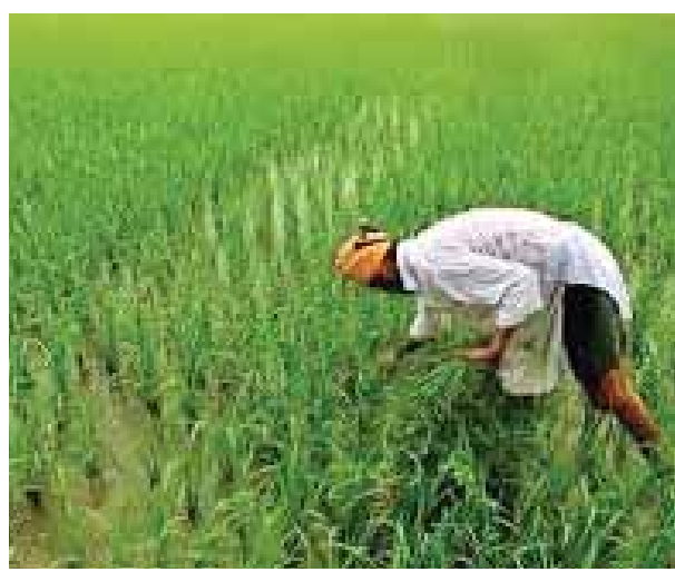
This success however comes with concerns, especially regarding soil health," the minister said. According to Chauhan, about 30 per cent of India's land is experiencing degradation due to rising fertiliser consumption, imbalanced use of fertilisers,

PTI ■ NEW DELHI Agriculture Minister Shri Singh Chauhan on Tuesday expressed concern over soil degradation affecting 30 per cent of India's land and stressed the need for urgent measures to maintain soil quality for sustainable farming. Addressing a global conference on soil through video conferencing, Chauhan said improving soil health is crucial for achieving Sustainable Development Goals (SDGs) related to zero hunger, climate action and life on land. "We are producing more than 330 million tonnes of foodgrains annually and exporting worth USD 50 billion.