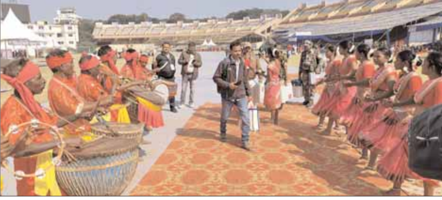
Polling officials carry election materials on the eve of the second phase of Jharkhand Assembly polls, in Ranchi on Tuesday.

Campaigning for the second and final phase of the Jharkhand Assembly elections concluded on Monday evening. The fate of 528 candidates contesting across a total of 38 constituencies that are going to polls in this phase will be decided on November 20. As per the data shared by the election commission, as many as 1.23 crore voters are registered to cast their vote in the second phase of the ongoing elections whereas in the second phase of the 2019 Jharkhand Assembly elections, the total number of registered voters were 1.09 crore. This time there are 62,89,974 male, 61,00,548 females and 145 voters are from the third gender. In the age-group of 18-19 years, 550614 electors are registered. Amongst them 241769 are male, 308841 are female and 4 are transgender voters. In the age bracket of 20-29 years, there are 3158673