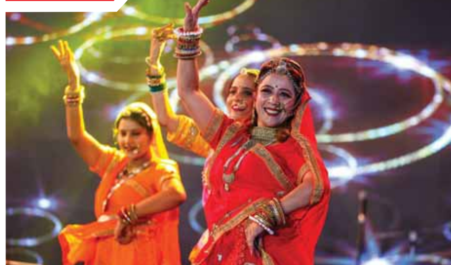
Folk dancers perform during the celebration of the 297th foundation day of 'Pink City', Jaipur