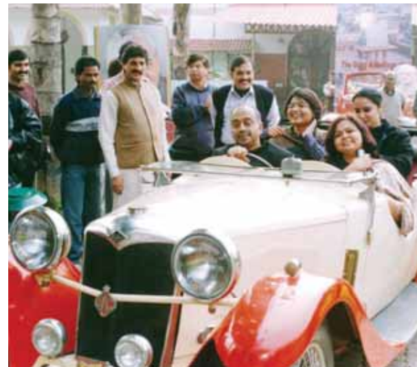
Former Union Minister Vijay Goel with one his coveted vintage cars which he used to take out as part of the exhibition he started to mark the birthday of former Prime Minister Atal Bihari Vajpayee

LG Saxena has directed that bona fide vintage vehicles will no longer face coercive action by the Transport Department and the Municipal Corporation of Delhi (MCD). According to Raj Niwas, the LG has asked the Commissioner Transport and Commissioner (MCD) to ensure that their enforcement wings desist from coercive action in case of such bona fide vehicles. Acting on a representation made by the Heritage Moringing Club of India, highlighting that their vehicles are being impounded by the authorities and requesting for clarificatory orders in this regard, the LG had asked his Secretariat to issue appropriate directions. The transport department's data shows there are