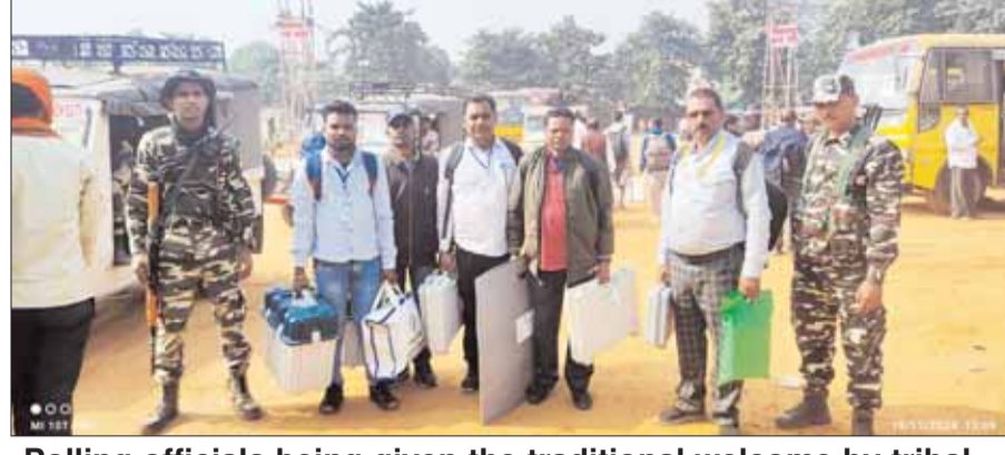
Polling officials being given the traditional welcome by tribal artists before they leave for their polling stations as they carry election materials on the eve of the second phase of Jharkhand Assembly polls, in Ranchi on Tuesday.

For the 1.23 crore voters, a total of 14218 polling stations have been set up- 2414 are in the urban areas while 11804 are in the rural areas. For the final phase of the election 335 special polling booths are also being made. Out of these, as many as 239 polling stations will be managed by women personnel and 26 by the youth. Persons with Disabilities (PwD) will man 22 polling booths while the remaining 48 fall under the