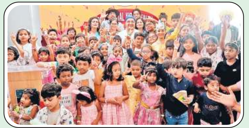
Continental Hospitals hosted its Kids Health Carnival on Tuesday, in Hyderabad. The event was organised to promote preventive healthcare, the event featured free pediatric, dental and ophthalmic check-ups, highlighting the importance of early detection of illnesses.