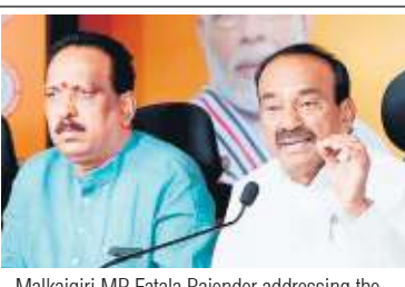
Malkajgiri MP Eatala Rajender addressing the media at State BJP office on Tuesday

PNS ■ HYDERABAD The BJP's Malkajgiri MP, Eatala Rajender, filed a complaint on Tuesday with the National Human Rights Commission (NHRC) regarding the Lagacharla incident. He posted on X regarding this and said, "Kodangal Constituency, Lagacharla incident has been brought to the attention of the NHRC (National Human Rights