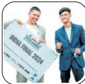
The Red Bull Basement India Finals captivated a full house at the Innovation Championship on Tuesday, where young minds presented groundbreaking ideas to panel of judges.