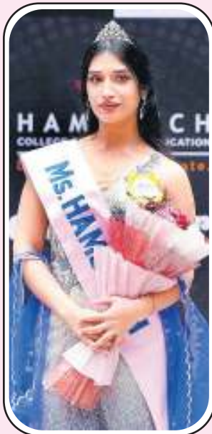
Hamstech College welcomed its freshers with a spectacular Indo-Western themed party, blending glamour, entertainment and fun. The event featured dazzling performances, delicious food, helping newcomers feel at home while celebrating community spirit.