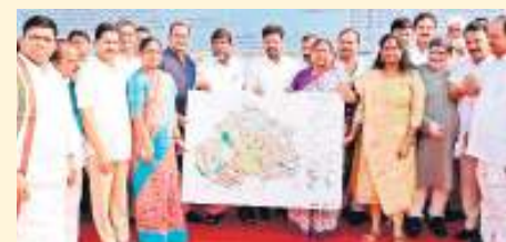
CM Revanth Reddy with Ministers, MLAs, MPs and others at Kaloji Kalakshethram with KUDA Master Plan-2041

Alleging that the opposition is conspiring against the TG Government, Chief Minister Revanth Reddy said the Congress Government will detect plots and jail the plotters. The Chief Minister said the government has decided to develop Warangal like Hyderabad and has initiated steps for that. "That is why the government allocated nearly Rs 6,000 crore