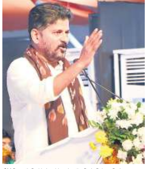
CM Revanth Reddy is addressing the Praja Palana-Praja Vijayotsavam public meeting at Warangal City on Tuesday