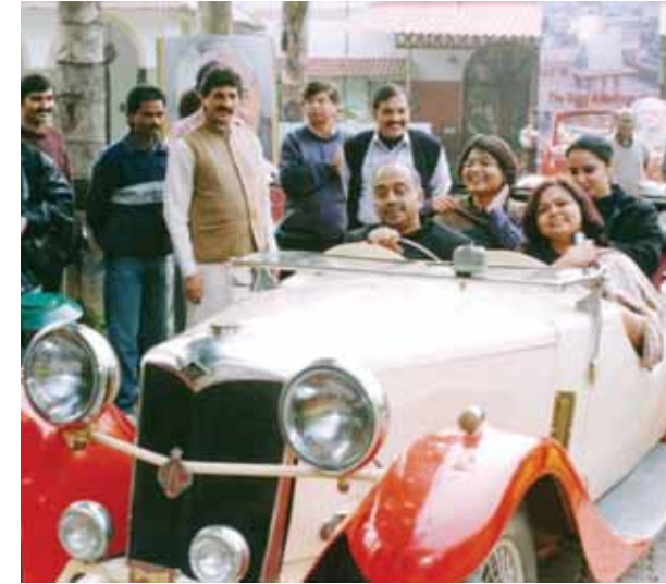
Former Union Minister Vijay Goel with one his coveted vintage cars which he used to take out as part of the exhibition he started to mark the birthday of former Prime Minister Atal Bihari Vajpayee

Acting on a representation made by the Heritage Motoring Club of India, highlighting that their vehicles are being impounded by the authorities and requesting for clarificatory orders in this regard, the LG had asked his Secretariat to issue appropriate directions. The transport department's shows tĥere are