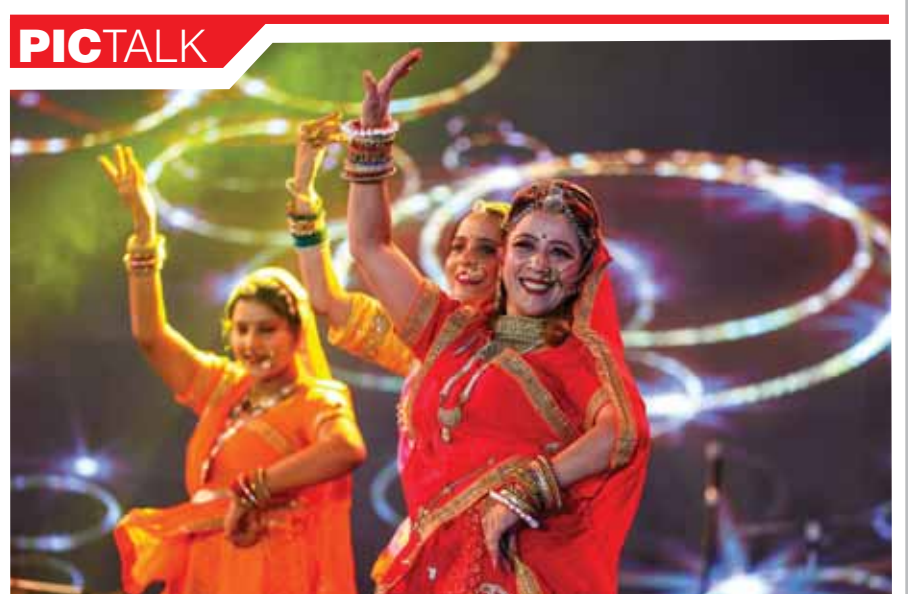
Folk dancers perform during the celebration of the 297th foundation day of 'Pink City', Jaipur

tion, highlighting the BJP's failure to protect Maharashtra's economic interests, including the recent relocation of major industrial projects to Gujarat. This election also reflects national-level dynamics. The results will test the BJP's ability to maintain its dominance amid growing opposition unity and could signal the strength of the Congress and its allies. A victory for the MVA might energise the national opposition, while a BJP win could consolidate its position. With a fragmented political landscape, Maharashtra's election promises to be closely contested. Its outcome will likely shape not only the state's future but also set the tone for national politics in the coming years. The political landscape of the state stands at a crossroads today. With a deeply fragmented Shiv Sena, intense debates over Maratha reservations, and agrarian distress weighing on rural voters, this election carries stakes far beyond the state's borders. The outcome would indeed be a pointer to the prowess of the BJP at the national level and the resilience of the INDI alliance. Besides the state is an economic powerhouse and whosoever rules the state also enjoys the support of corporate world to keep its momentum