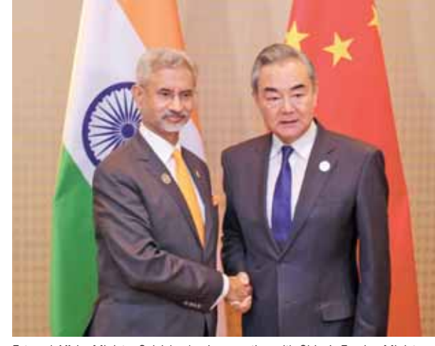
External Affairs Minister S Jaishankar in a meeting with China's Foreign Minister Wang Yi on the sidelines of the G20 Summit in Rio de Janerio

last month. Days after the two sides reached an agreement on October 21 on disengagement in Demchok and Depsang, Indian and Chinese militaries completed the process marking a virtual end to over four-year standoff in the two