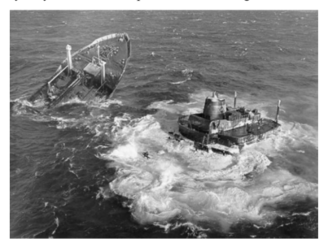
The Argo Merchant, 1976

In the twenty years from the mid 1980s through the early twenty-first century, at least another 14 open registry systems were developed, mostly by former colonial dependencies. Many of these systems became notorious for their low wage scales and otherwise exploitative labor conditions. By the 1990s, the London-headquartered International Transport Federation (ITF), a confederation of seafarers and longshoremen's unions around the world, would sometimes declare a particular open registry a "flag of convenience." When they did so, they signaled member unions to boycott, if possible, ships registered in those countries. Some open registry systems, which are known for relatively fair labor practices, have not been designated "flags of convenience" by the ITF. For this reason, the terms "open registry" and "flag of convenience" are not exactly synonymous from the point of view of organised labor.<sup>2</sup>