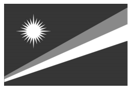
Marshall Islands, orange and white on blue.

1980s, jurisdiction over certain Pacific islands as "Trust Territories." These island groups had been occupied by Japan prior to the Second World War II, and were still administered by the United States under United Nations authority. Under the Compact of Free Association signed with the United States in 1986, the Marshall Islands gained full sovereignty over domestic affairs, citizenship, and such legislation as its internal maritime and labor codes, while delegating the handling of some foreign affairs and all