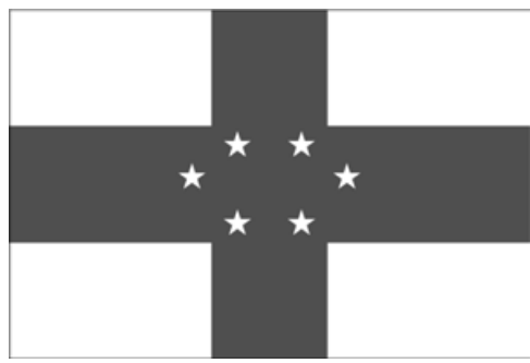
Netherlands Antilles; blue on white.

Another political difficulty arose when a series of referenda in 2005 led to a plan to dissolve the Netherlands Antilles into five separate states, planned for 2008. Delays in implementing the plan left it unclear whether the ship registry would remain in Curaçao, the main center for offshore operations, or would lead to several separate registries in two or more of the new states that may emerge from the Netherlands Antilles dissolution. Although open to