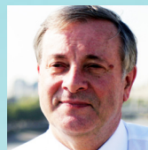
ALISTER MCGRATH (virtual)

To each is given the manifestation of the Spirit for the common good. –1 Cor 12:7