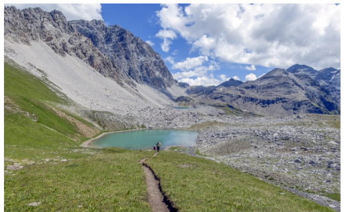
A path near Pfäffikersee.

The External Relations, Public Policy and General Partnerships programme aims to advance the themes of digital and open knowledge in society and politics at the national and international levels while helping Wikimedia CH become a recognised player within the Wikimedia Movement on themes concerning our vision and strategic impact directions. We will participate in working groups and coalitions to advance digital and open-source themes in society and politics while supporting civic action groups with our own knowledge and expertise, as well as that of relevant partners.