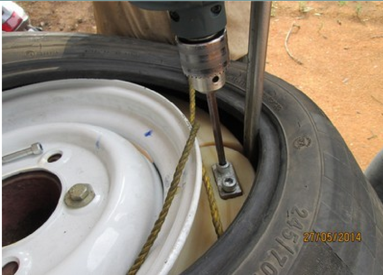
LAND ROVER DISCOVERY RUNFLAT INSERTS