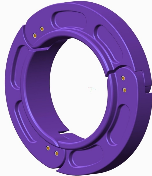
3 piece Runflats for 20" wheel Rims for Mine Protected Vehicles