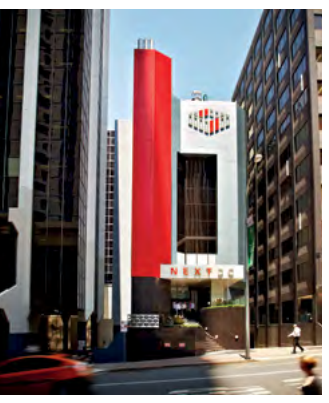
B1 Brisbane 20 Wharf Street, Brisbane City QLD 4000