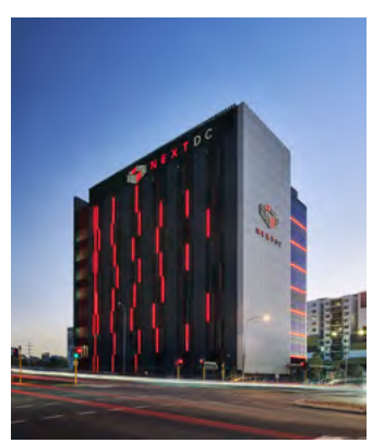
P2 Perth 11 Newcastle Street, Perth WA 6000