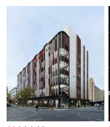
A1 Adelaide 125 Frome Street, Adelaide SA 5000