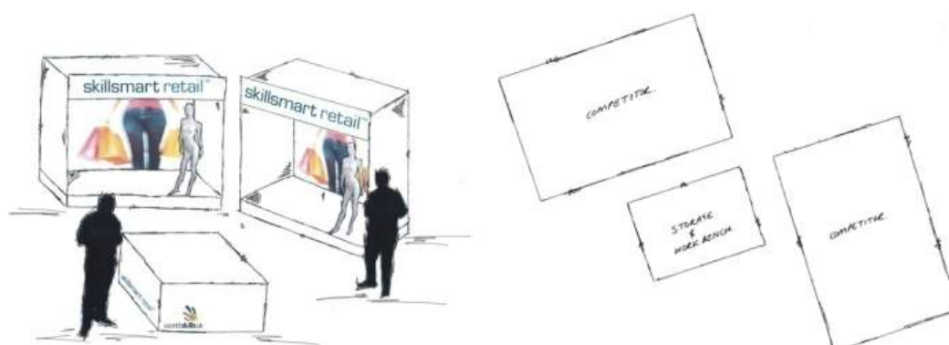
Floor sketch of one competitor area

Each competitor will have a working area and two mock shop windows of approximately 9m 2 . The working area will be based around a workbench approximately 1.5 m 2 with built in storage and additional storage space. The two mock shop windows will measure 2m length x 1m depth x 1.5m width. Each window will have three walls, a grid ceiling and an open front with 3 adjustable spotlights. A storage area measuring approximately 4m 2 will be available for each competitor.