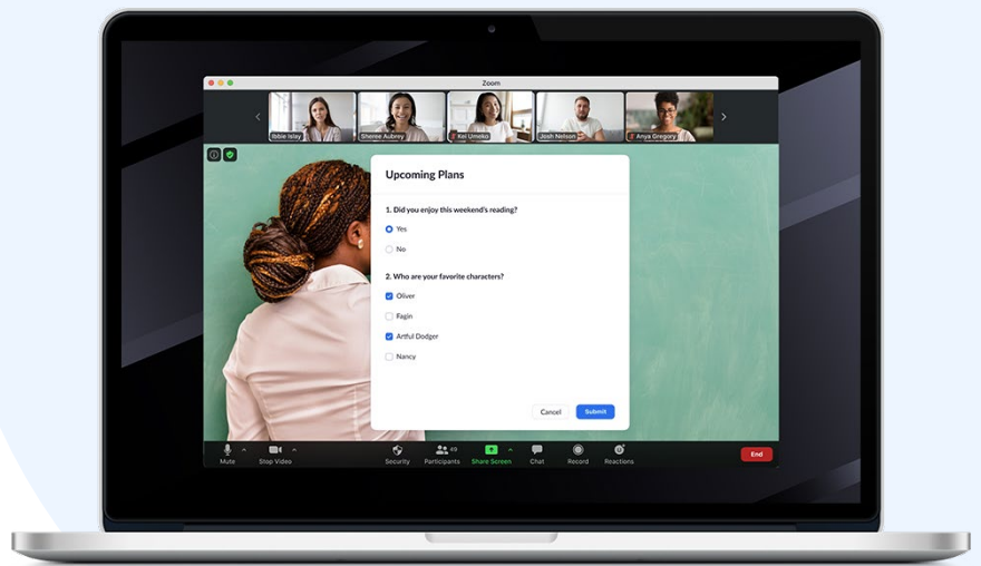
Polling and Q&A enhance collaboration

Easily create and repurpose video content into easily-digested hosted videos that allow students to learn at their own pace.