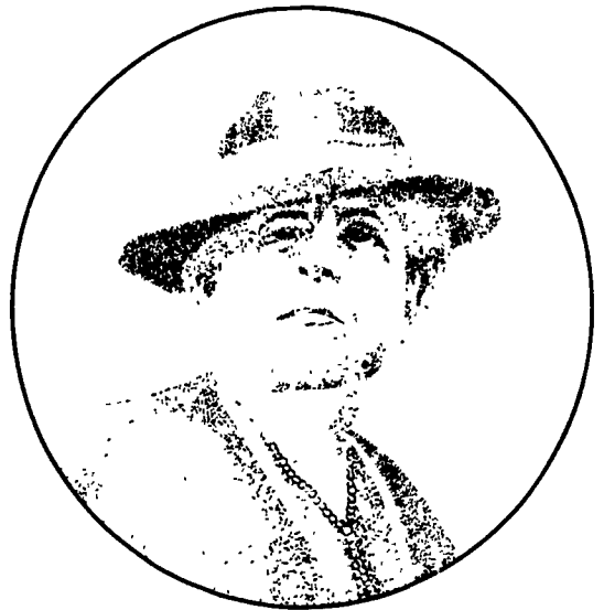
FRANCES BENJAMIN JOHNSON 1864 - 1952

Photographer, photojournalist, and first American journalist to use her photographs to illustrate her articles