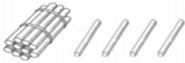
Bundle of ten sticks and four individual sticks