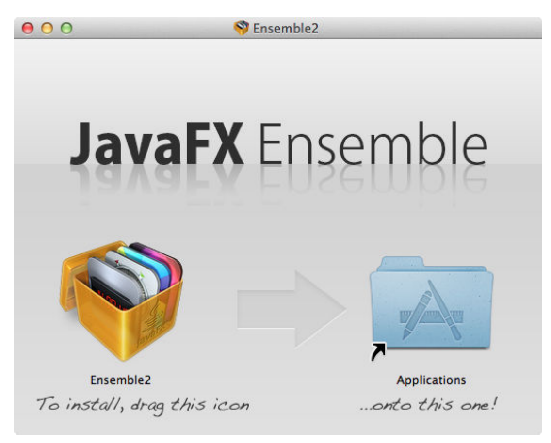
Figure 2-4 Example of Customized Appearance of Installable Package for macOS

To fine tune the self-contained application folder before it is wrapped, provide your own bash script to be executed after the application folder is populated. You can use the script for such actions as adding localization files to the package. Figure 2-4 shows an example of a "tuned" application installer.