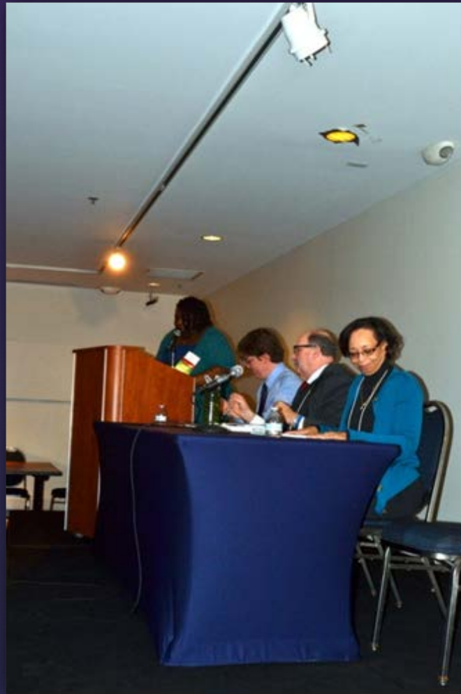
Panel - Activism and Public Works on Saturday, November 22, 2014, 11:00 a.m. – 12:15 p.m.