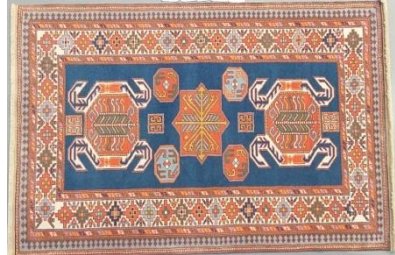
Bakhmanli (Talish) carpet