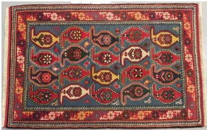
Butalı Karabakh carpet