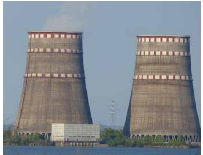
Cooling towers at the Zaporizhia nuclear plant, Ukraine

Through our continued efforts, in 2017 the parties to the Espoo Convention formed a working group to examine further the applicability of the convention to nuclear power lifetime extensions, which is an important step towards recognizing that the potential impact of nuclear power plants knows no borders, and that all potentially affected citizens should have a say where the life extension of old nuclear power stations is concerned.