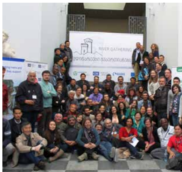
River defenders from around the globe gather in Tbilisi

The location for the event was not a coincidence - Georgia's rich water resources are under threat from the government's haphazard energy development plans, so the meeting was as much a strategy session as a solidarity one, with the gathering culminating in a show of support for Georgian river defenders and their struggles.