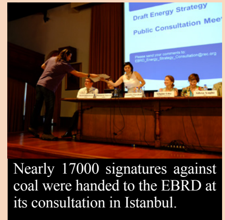
Nearly 17000 signatures against coal were handed to the EBRD at its consultation in Istanbul.

its controversies. By the end of the year, the EBRD had pulled out of Kolubara B, a massive victory for our Serbian colleagues.