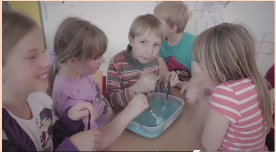
Children in Prague build a model of their school using gingerbread in our video clip to illustrate how one EU project achieved near passive standards for their elementary building, saving money on energy bills for their municipality and improving the quality of life for the students in the process

We started by building alliances and coalitions across Europe with groups concerned about how their governments intend to spend their portions of the EU budget. Our outreach culminated in an international forum and the signing of the Wandlitz Declaration, a joint statement endorsed by eleven of some of the largest NGOs from around Europe, urging the