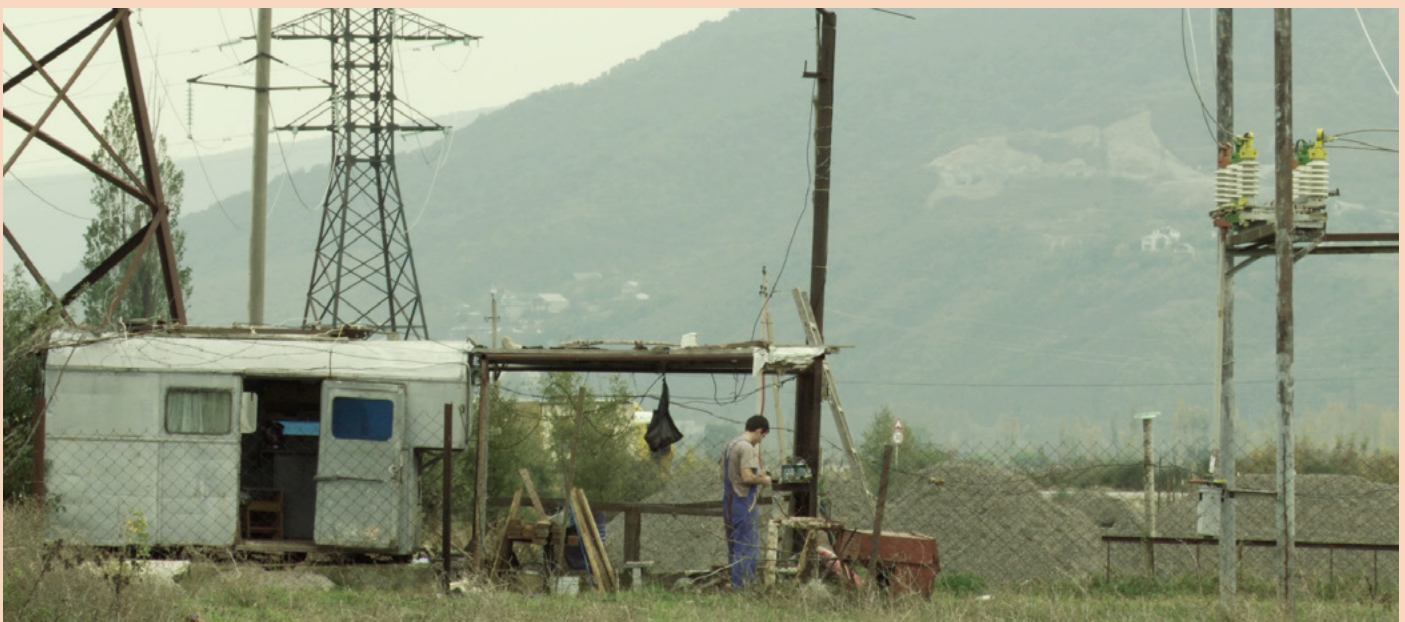
A scene from ‘How we live,’ a Bankwatch production featuring our energy campaigns in Serbia and Georgia that made the rounds on the international film festival scene including New York and Barcelona.

For a comprehensive look at our campaign on the energy policies, visit bankwatch.org/campaign/energy-lending