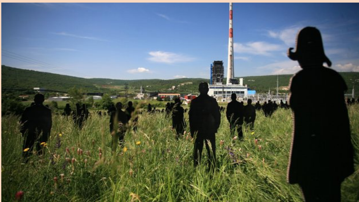
Action held outside the Plomin coal plant, with cardboard cut-outs standing in for the nearly 700 premature deaths that would be caused by air pollution from the project.

received a boost in October when it was announced that the second of four shortlisted investors had pulled out of the bidding for the 800 million euros project. With just two investors remaining and a court case challenging the spatial planning permit pending, hopes are high that another climate time bomb in southeast Europe will be avoided.