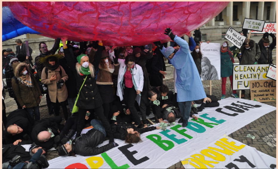
On the sidelines of the UN climate summit in Warsaw with an eight-metre inflatable lung in tow, Bankwatch helped organise a rally to tell the EBRD to put people before coal

One of the first steps in our campaign was to link with other