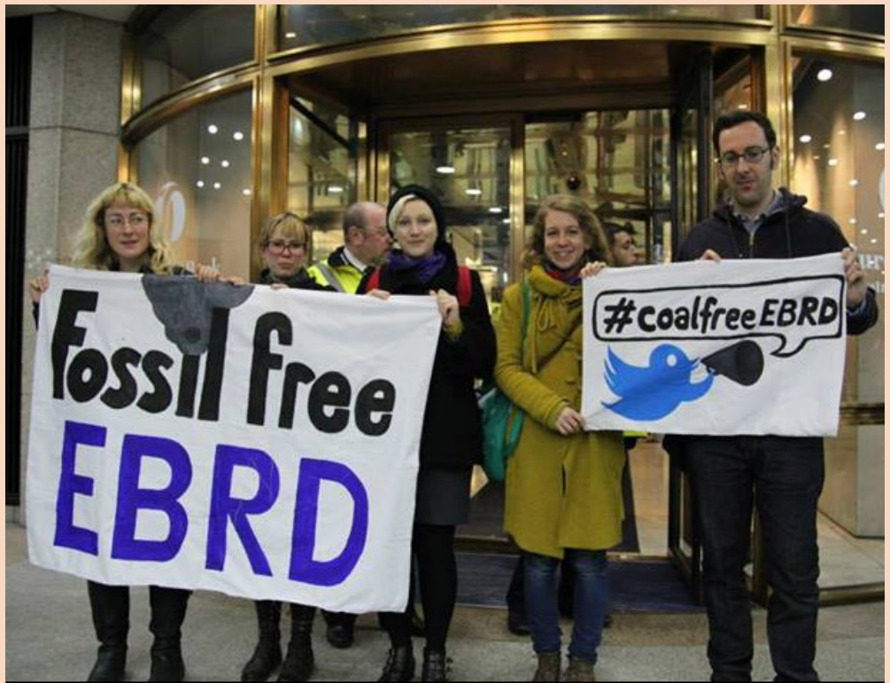
Bankwatch partner Platform holds a small demonstration outside EBRD headquarters in London

Quite a shift for the bank who just months before had argued that it would not be ‘ideological’ about climate change.