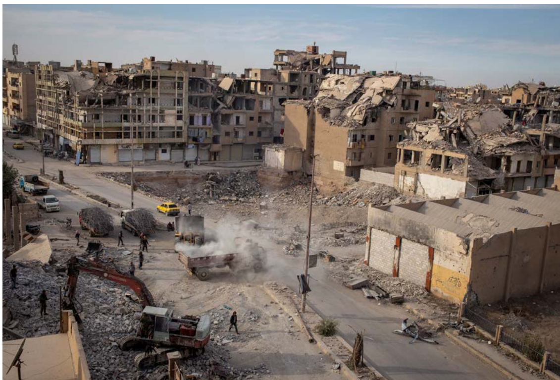
Destruction in Raqqa. (Image courtesy of Donatella Rovera, Amnesty International).

The time required to rebuild the city of Raqqa in the three years since its liberation from ISIS shows that long after the bombs have stopped, explosive weapons with wide area effects continue to disrupt and harm civilian lives.