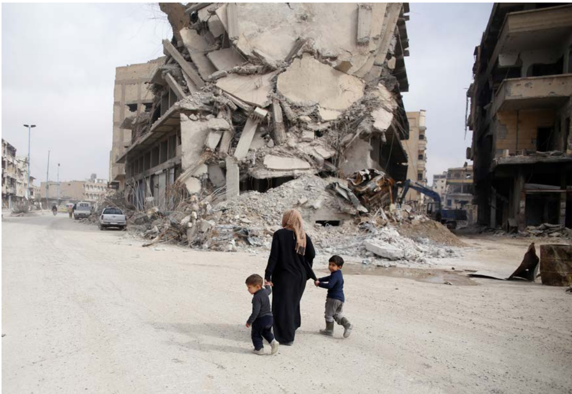
Destruction in Raqqa.

In the next three chapters, we will further examine how the use of explosive weapons in Mosul, Raqqa and Hawijah has significantly impacted the lives of civilians, and continues to do so today.