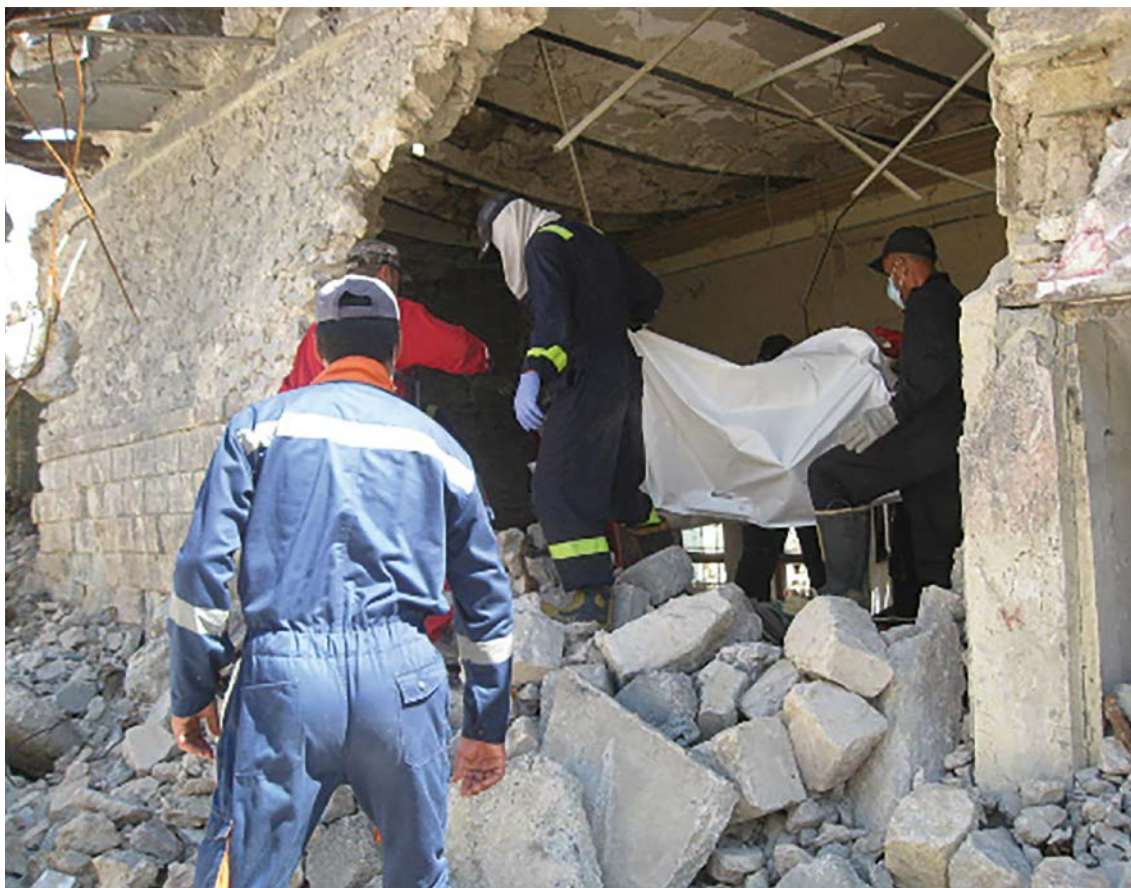
A federal Iraqi recovery team removes a body from the ruins of west Mosul, May 2018. (Image courtesy of Mosul Eye).

More than 3,000 corpses of both fighters and civilians were in fact removed from the Old City by federal recovery teams in early 2018, according to official reports, although such details were later censored. Over just four days in May 2018, for example, some 763 bodies were retrieved from the banks of the River Tigris in Old Mosul. 54