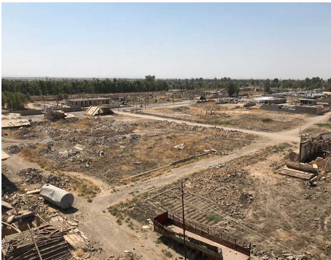
Photo showing part of the impacted area in Hawijah, September 2019.

One example was given where a family had to pay bribes worth half of the amount of the compensation in order to secure payment. 150