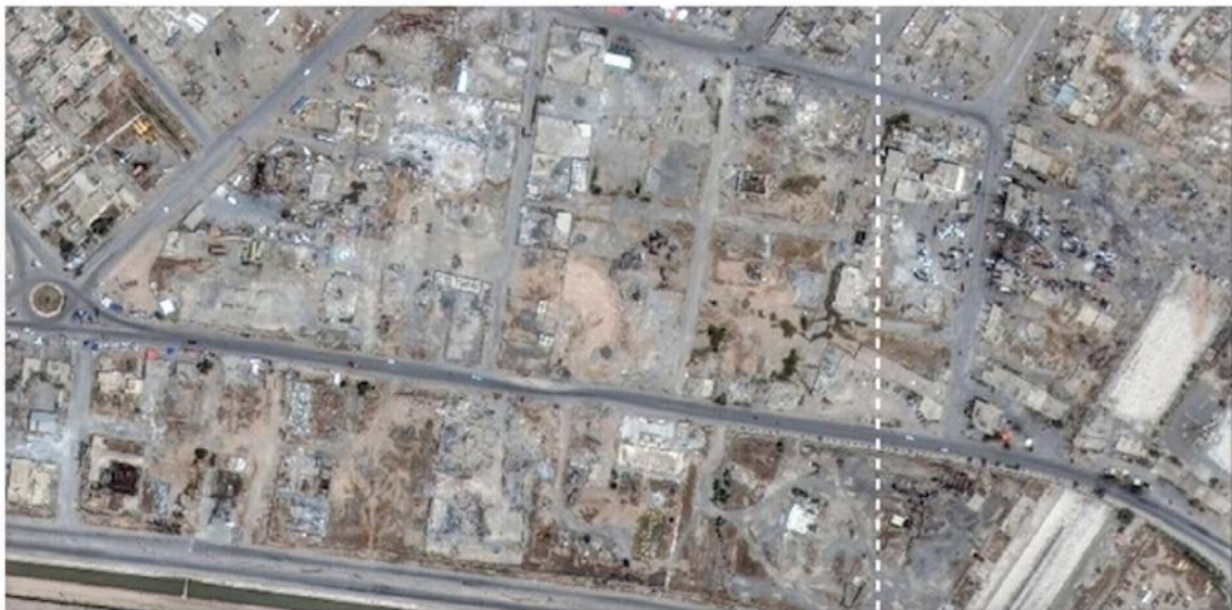
Photos of Hawijah industrial area and adjacent areas before and after the attack.