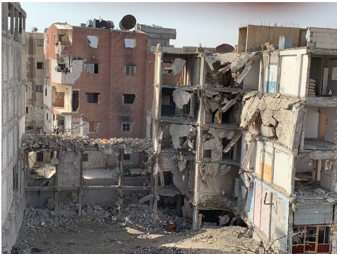
Destruction in Raqqa. (Image courtesy of Donatella Rovera, Amnesty International).

While the Pentagon's public position remains that civilian harm from Coalition actions at Raqqa was relatively limited, Department of Defense officials were concerned enough by the Amnesty/Airwars study to commission its own review of the Battle of Raqqa from the RAND Corporation, which was due to be published in late 2020. 94 However, several sections of that report are expected to remain classified.