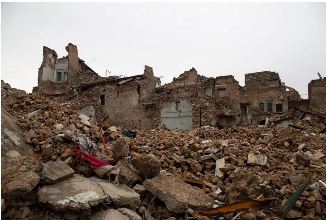
Destruction in Mosul. (Image courtesy of Donatella Rovera, Amnesty International).

According to Amnesty, this incident was “exceptional only in the sense that it had such a high civilian death toll and the fact that—due to its high profile—the US military investigated the incident and disclosed its findings.” 66 Amnesty concluded that Iraqi and Coalition forces “appear to have repeatedly carried out indiscriminate, disproportionate or otherwise unlawful attacks, some of which may amount to war crimes”. 67