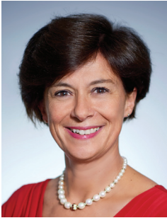
Susan Danger CEO AmCham EU

The Portuguese Presidency of the Council of the European Union (EU) comes at a critical juncture for the EU. In light of the two-pronged health and economic crisis that the global pandemic has provoked, the Portuguese Presidency will play an instrumental role in charting Europe's recovery. With the EU's long-term 2021-2027 budget – linked to the historic NextGenerationEU recovery instrument – agreed, the work to shape Europe's future must now begin in earnest. Developing Europe's resilience, while rebuilding a more sustainable economy that focuses on the twin transitions of environmental protection and the digitisation of the economy, will be key priorities for the Portuguese Presidency.