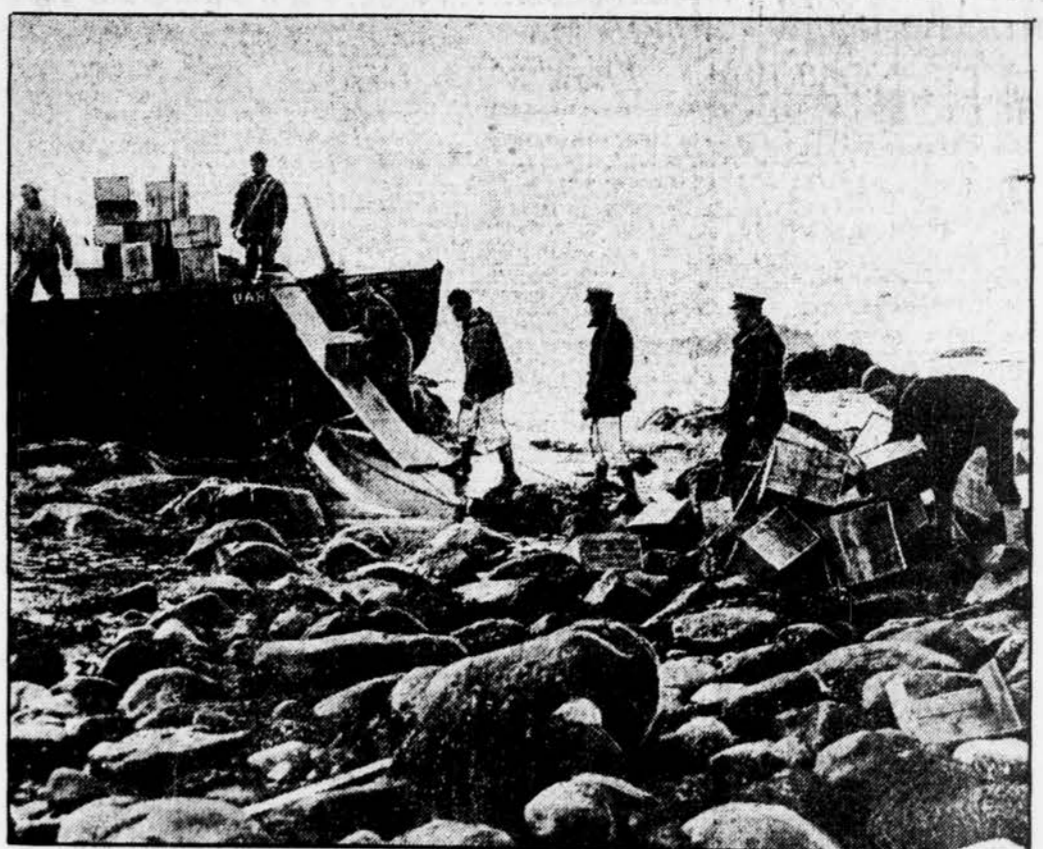
AGROUND IN THE FOG, VESSEL GIVES UP $30,000 WORTH OF LIQUOR. The good ship Barbara went ashore last Friday at Fishers Island, New York Harbor. The Coast Guard men investigated and discovered 600 cases of liquor aboard. They confiscated the illicit cargo, and the photograph was taken while the cases were being unloaded.