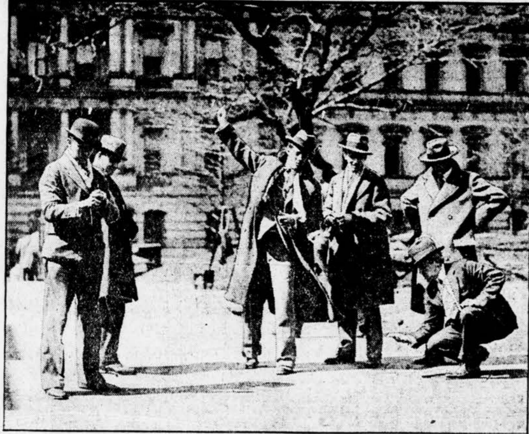
WHAT'S THE MATTER WITH THE YOUNG MAN OF TODAY? Heretofore, a greater part of the discussion has concerned the flapper, but the male probably needs as much attention. These boys, members of the Atlantic City High School team which recently won the intercollegiate swimming championship, visited the White House yesterday. And while waiting to see the President spent their time spinning tops on the pavement! The boys claim the fad has been taken up by students at Yale.