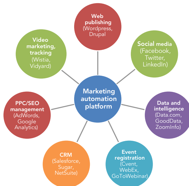
Table 3: The expanding B2B marketing automation ecosystem

The speed of marketing automation change has led even the largest vendors to open their platform architecture to facilitate integration with a wide range of independent software vendors (ISVs).