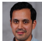
EUROPEAN PARLIAMENT OUTREACH Quang-Minh Lepescheux Microsoft