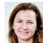
DIGITAL ECONOMY Pastora Valero Cisco